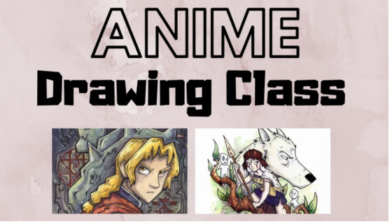
For 6th - 12th graders. Supplies needed: pencil, eraser and paper.