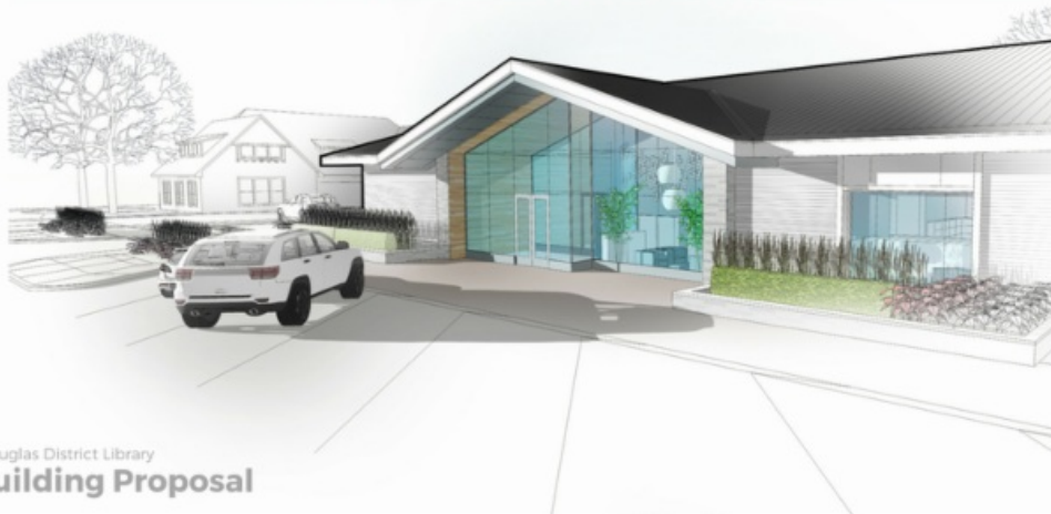
Saugatuck-Douglas District Library New Building Proposal

The Library bond proposal has been approved! Voters passed the initiative 64% to 36% on Tuesday, August 7, 2018. Thank you to everyone who voted.